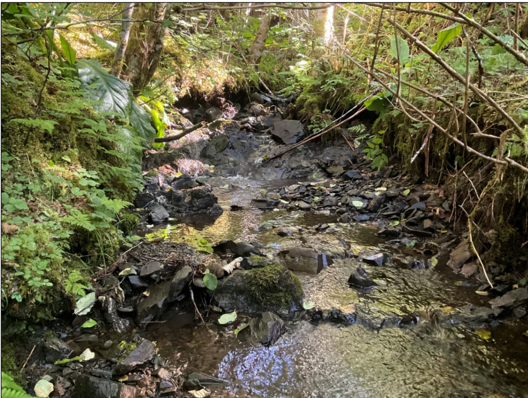
Figure 3.—Tributary 1 with bedrock becoming exposed just upstream of waypoint 1557.