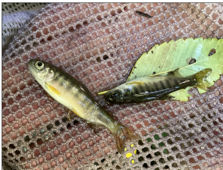
Figure 1.—Juvenile coho salmon captured at waypoint 1557.