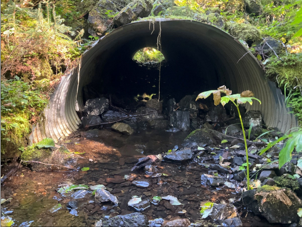
Figure 2.—Culvert outlet at waypoint 1557.